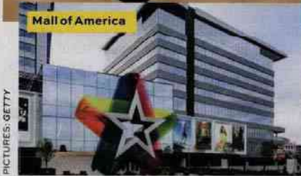
Mall of America