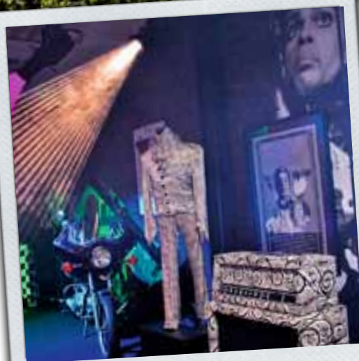
Prince's Paisley Park home

For evening entertainment, the Celebration Belle Captain's Dinner and Dance Cruise is a charming boat ride along the Mississippi River. Be prepared to join in with line-dancing to the country tunes provided by the live band. They also take song requests – even One Direction!