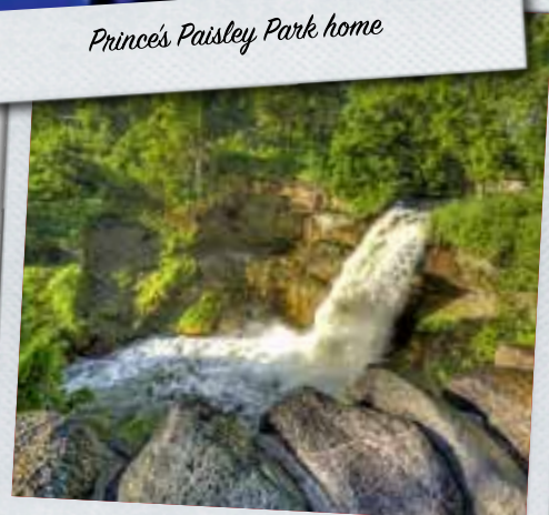
The spectacular Minnehaha Falls

Visit bon-voyage.co.uk and greatlakesusa.co.uk for more information and suggested itineraries. Prices start from £1,845 per person, which includes large car hire (drop-off fee applies), three nights in Chicago, two in Springfield, two in Collinsville, two in Moline, one in Winona and three in Minneapolis/Mall of America as well as flights with Delta Airlines. For independent car hire visit affordablecarhire.com .