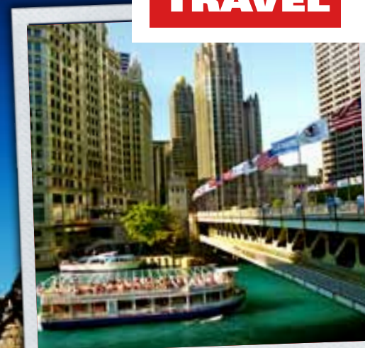
Cruising on Chicago River