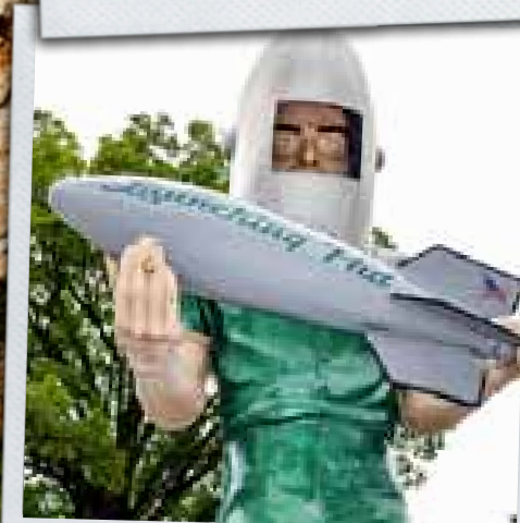
The Gemini Giant outside The Launching Pad restaurant