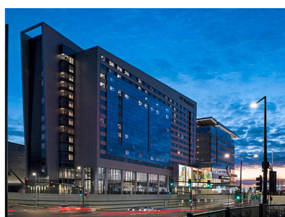
Mall of America