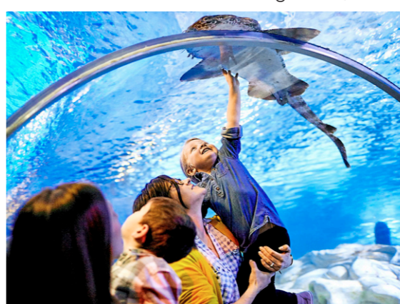
An aquarium inside the Mall of America