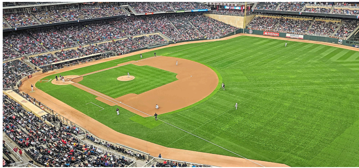
Target Field, home of the Minnesota Twins

A complex of wooden lodges set amongst the trees along the banks of the river offer a cosy end to the first day. With evenings meals and a hearty buffet breakfast