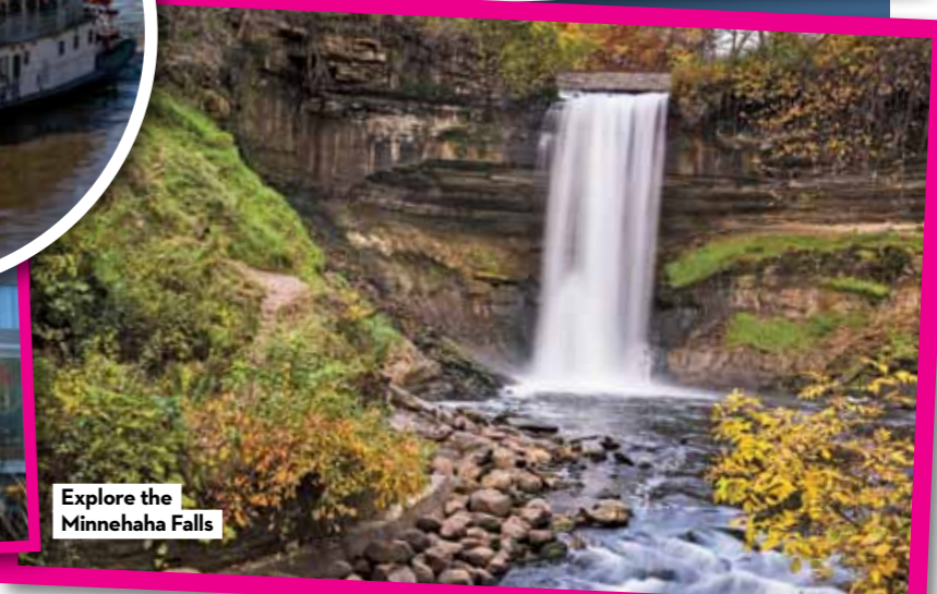
Explore the Minnehaha Falls