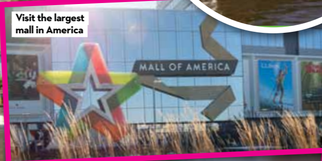
Visit the largest mall in America