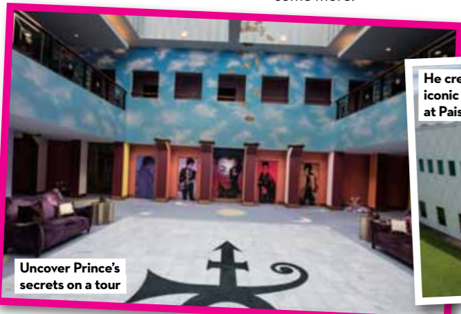
Uncover Prince's secrets on a tour