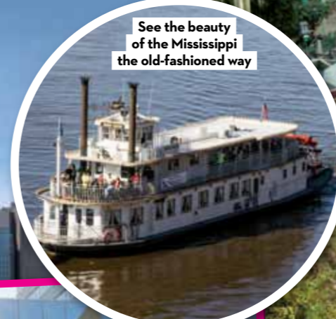
See the beauty of the Mississippi the old-fashioned way