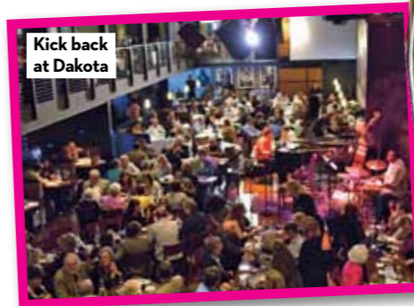
Kick back at Dakota