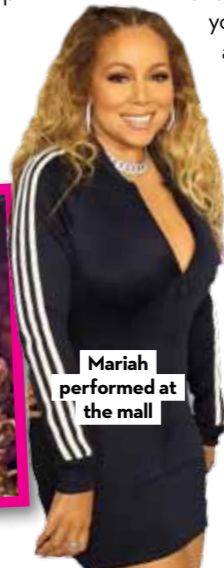
Mariah performed at the mall