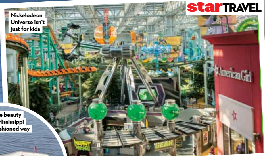
Nickelodeon Universe isn't just for kids